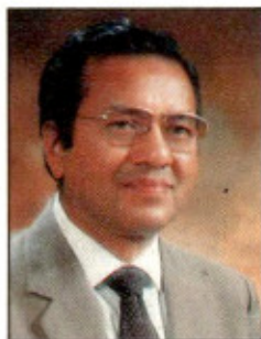
DATO SERI DR. MAHATHIR BIN MOHAMAD PRIME MINISTER OF MALAYSIA

Dr. Mahathir is a medical doctor who has attended numerous international seminars, including the International Affairs Seminar at Harvard in 1967.