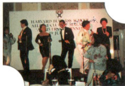
The Alumni Members dancing to the tune of Samba and enjoying their dinner during the Anniversary Dinner on 19th July 1992. The Club was formed 15 years ago on 19th July 1977.