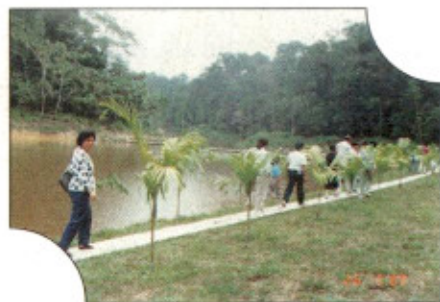
The members and their families on a field trip during the family day at the Nature Park in Shah Alam, Selangor in February 1989.