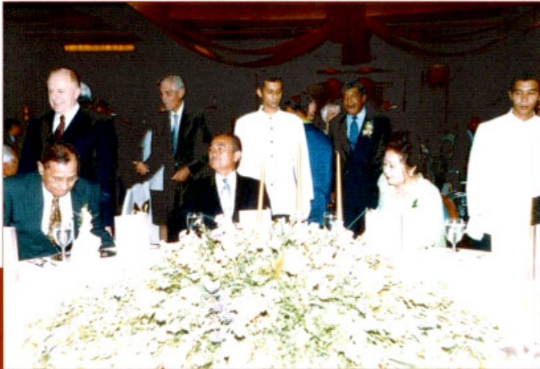
"All the Kings men" ... the VIPs taking their places.