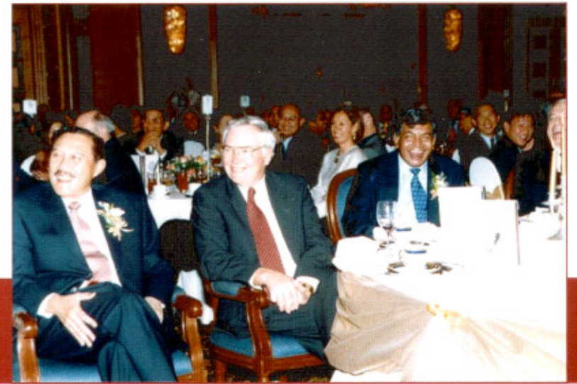
"funny business" ... dignitaries sharing a light moment.