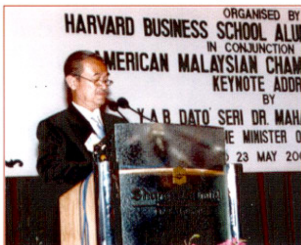
"VIP Touch" Deputy Prime Minister, Dato' Seri Abdullah Ahmad Badawi saying a few words.

Ladies and Gentlemen, The past twenty years has brought tremendous change to Malaysia and the next twenty years will no doubt bring about even greater transformations. Not only is Malaysia changing rapidly but so too is the world around us. We have tried to keep abreast of transitions in the global political economy. When Dr Mahathir became Prime Minister in 1981, our economy had yet to embark on massive industrialization. Our economy was still reliant on primary industries, agricultural and mineral commodities which together contributed 88.3 % of Malaysia's exports in 1960, still accounted for 77.4 % of our exports in 1980. We knew we had to move away from excessive reliance on primary commodities with policy shifts in place, we moved our economy along from one that was agricultural to one that became industrial.