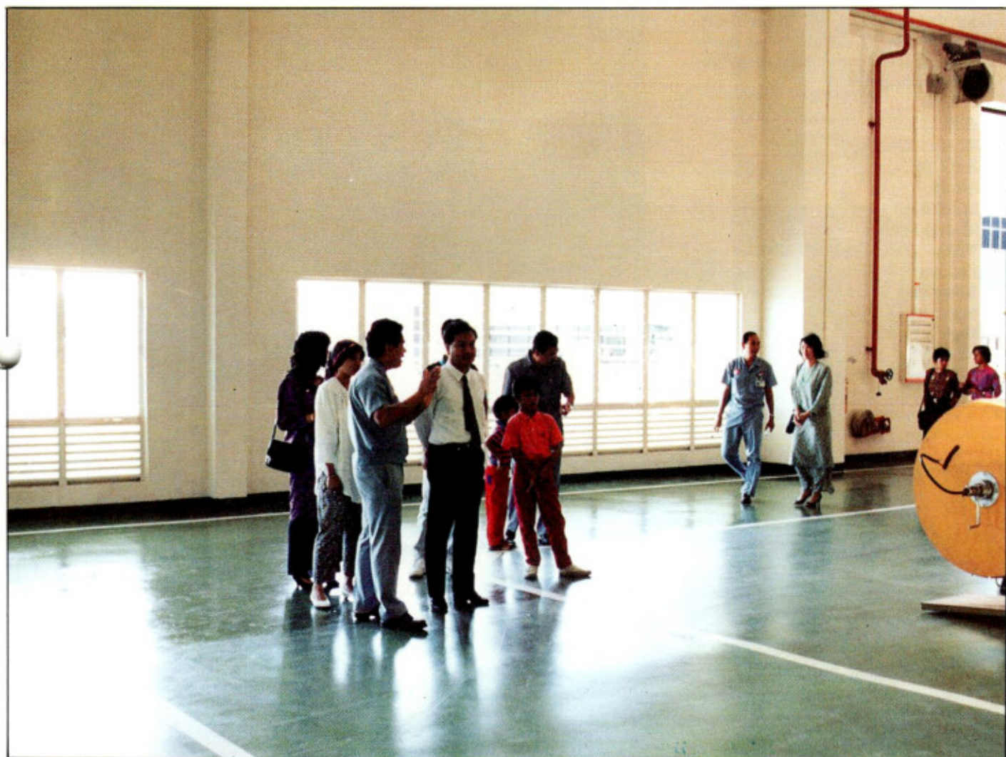
Tour of the factory