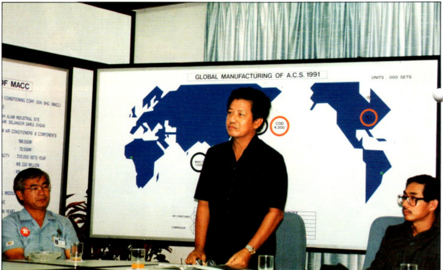
Thank you for the hospitality