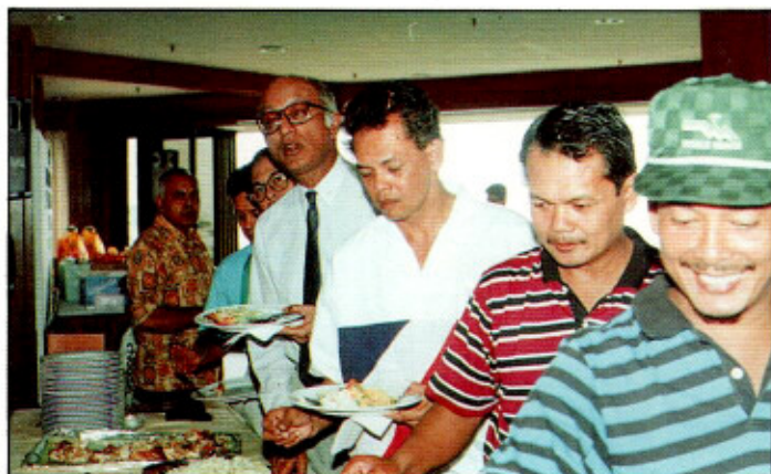
Time to restore stamina