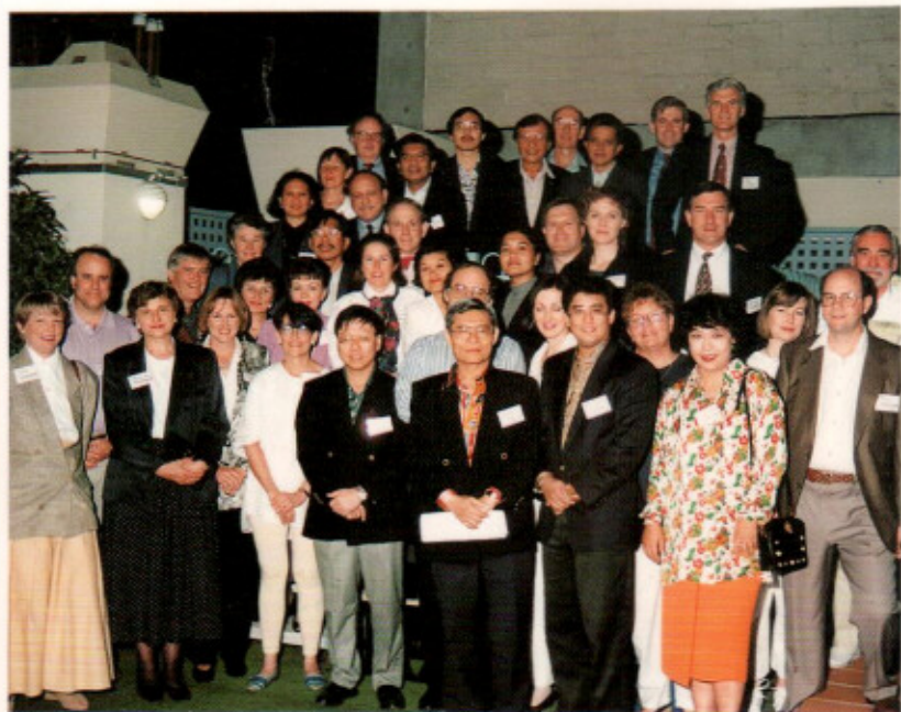
Group photograph of delegates to the Brisbane Regional Harvard meeting held at the end of October 1994. The Malaysian Harvard Business School Club sent a large contingent of nine members.