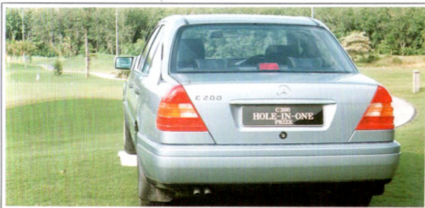
The mouth watering Mercedes Benz C200 - the prize for a hole in one !