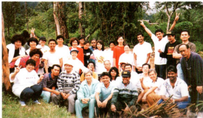
GROUP PICTURE OF PARTICIPANTS AT JANDA BAIK

The Club is now examining the possibility of assisting NGO managers further, by arranging for and sponsoring places at a similiar program conducted by the Harvard Business School in Boston, USA.