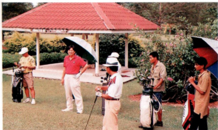
VISIT TO SARAWAK ... more golfing pictures