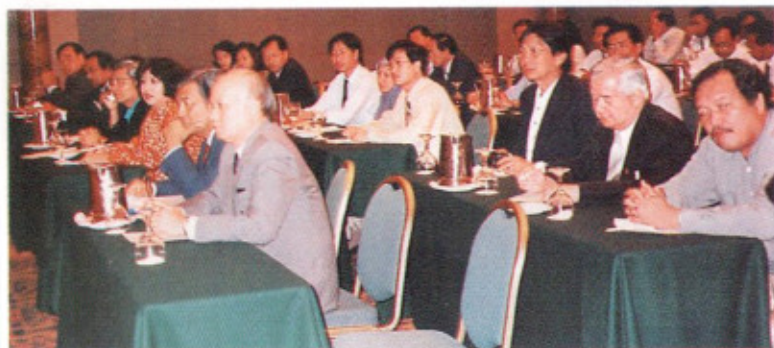
The theme was STRATEGIC POSITIONING