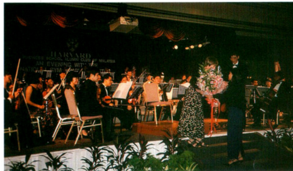
The National Symphony Orchestra performed at the Manager of The Year Award Dinner.