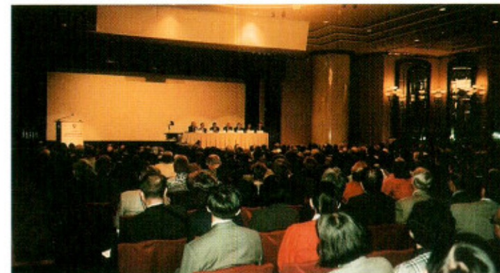
The Global Conference Hong Kong 1997.