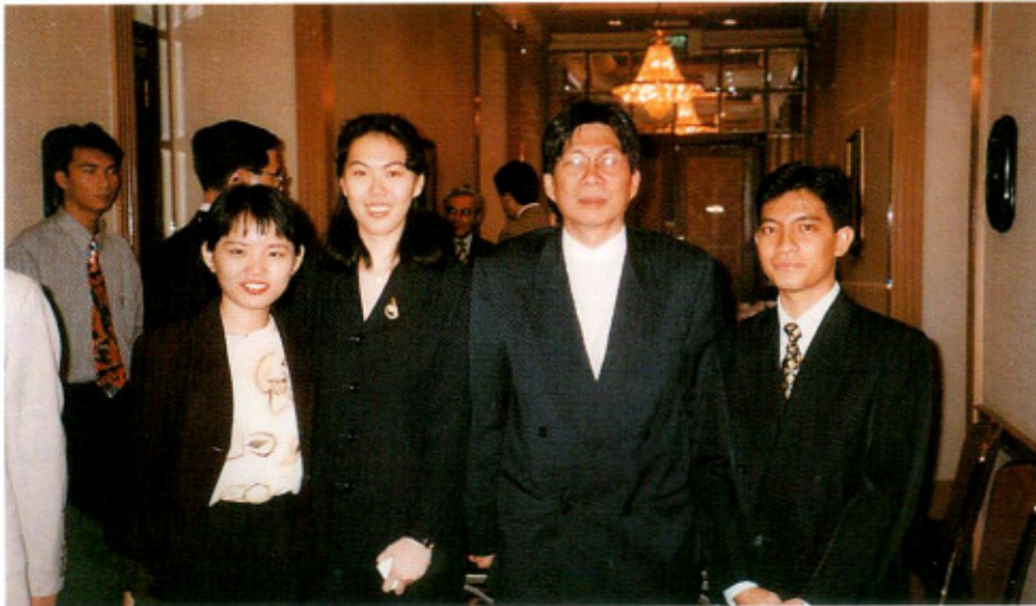
The recipients with the Honorary Secretary.