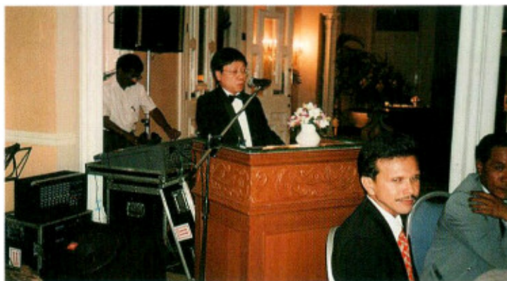
The President's address.

The highlight of the evening was the launch of the HBSACM website by the President.