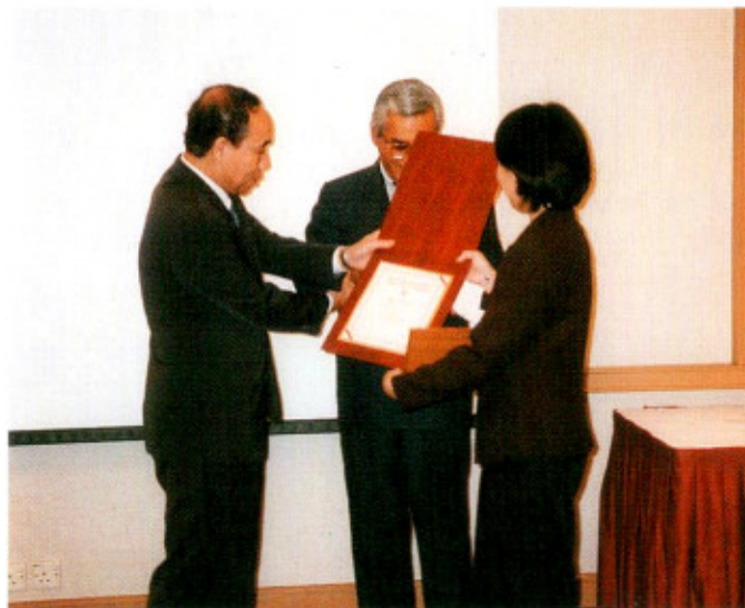
"Thank you HBSACM for the Award".