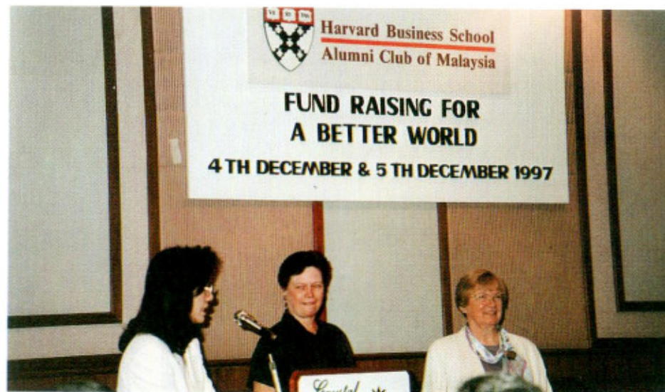
Introducing the speakers.