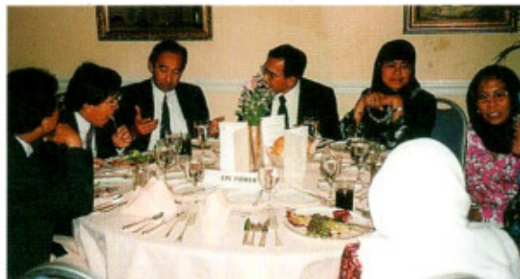
Members enjoying their dinner.