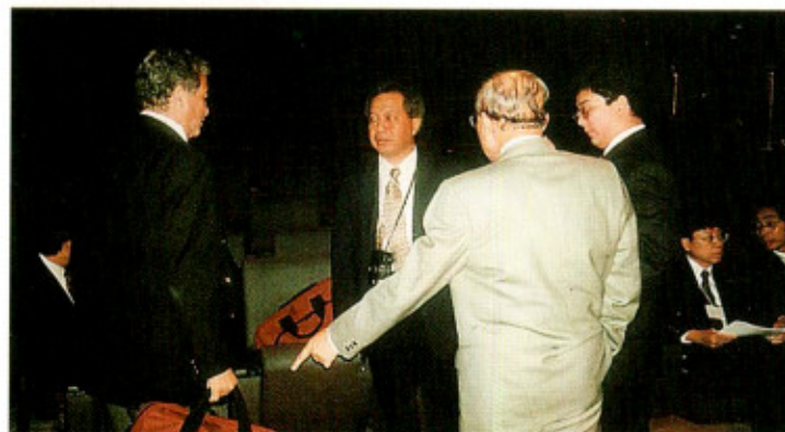
Discussion - prior to meeting HBS professor at the conference.