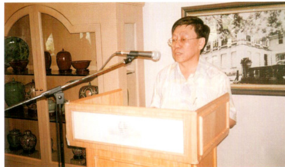
Thank you for playing inspite of the "jerebu".