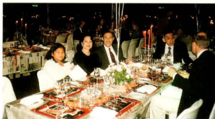
The farewell dinner at the Global Conference Hong Kong 1997.