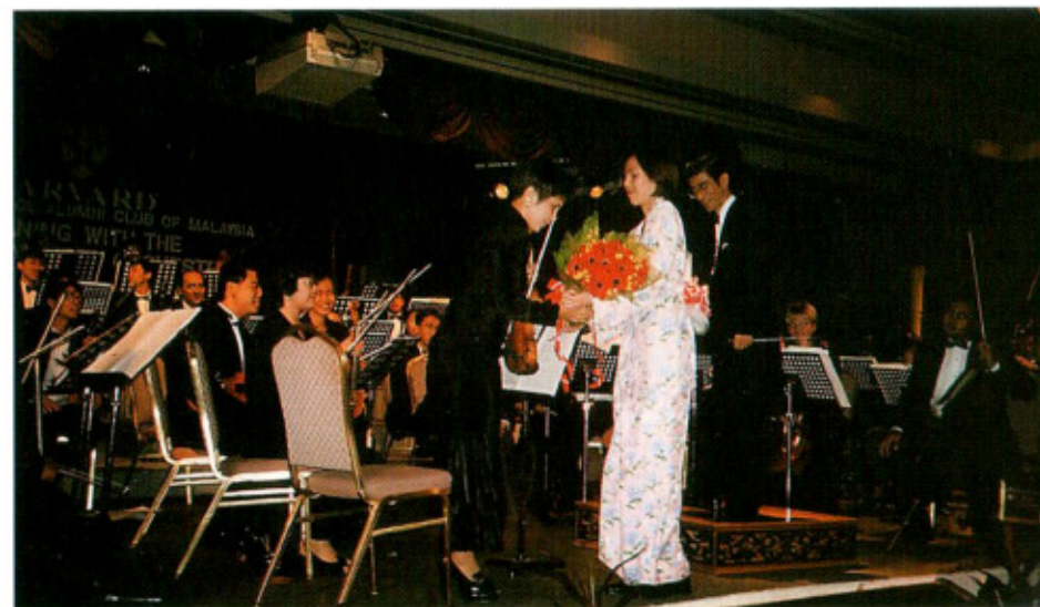
Bouquet for the National Symphony.