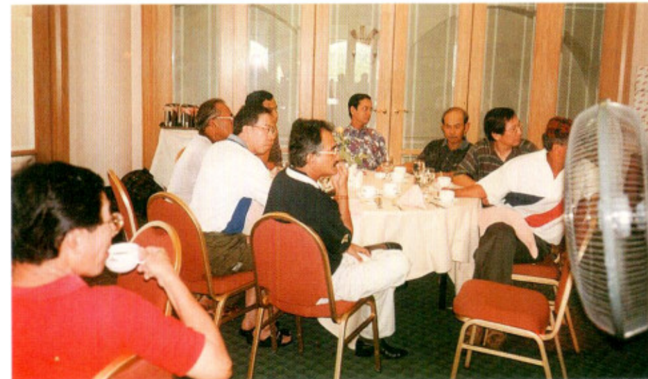
Awaiting anxiously for their names to be called.