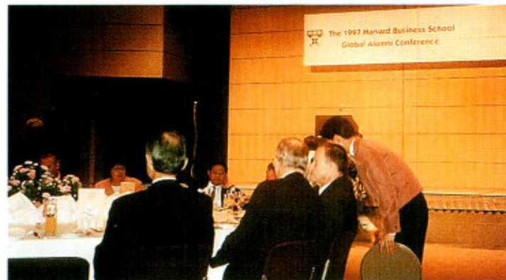
Opening lunch at the Global Conference.