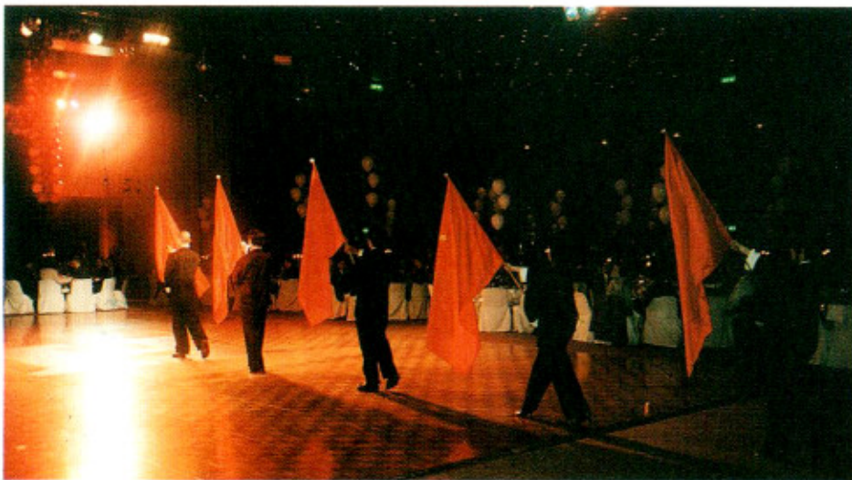
Red flag over Hong Kong - pre July 1997.

The next conference will be held in Chicago, USA in June 1998.