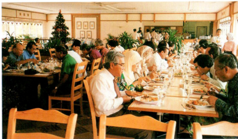
President and the members enjoying a hearty meal at the Concorde Inn Restaurant, KLIA Sepang.