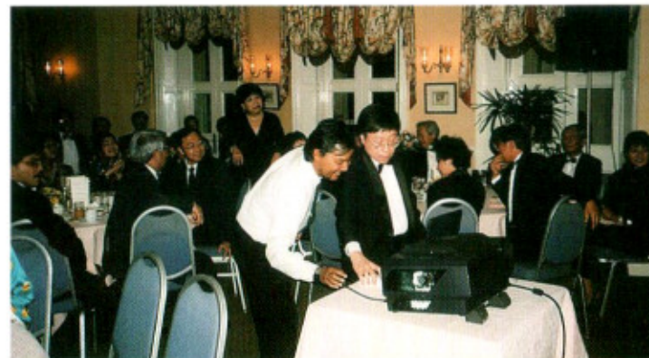
Launching of HBSACM Website by the President. "Where is the button to start it" enquires the President.