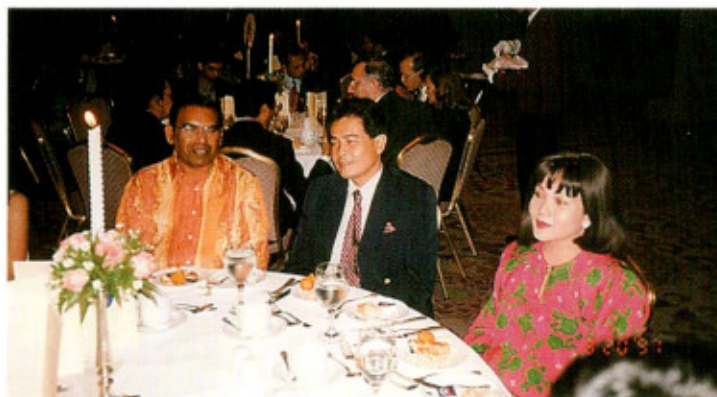
"It should have been a candle light dinner for two".