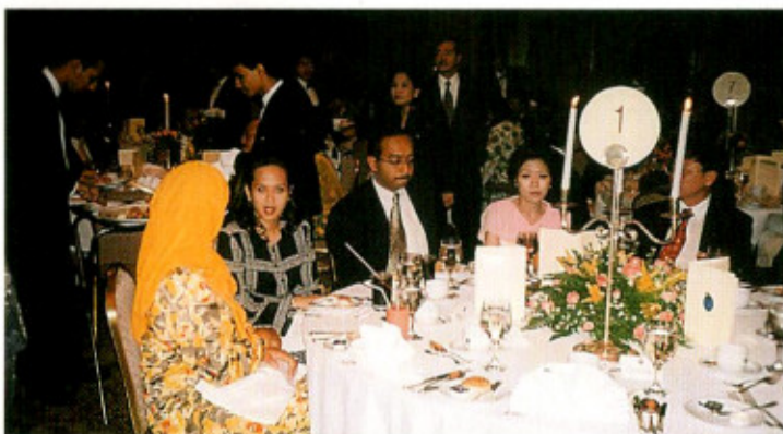
Guests of honour.