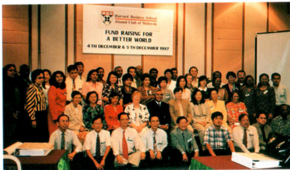
One for the album.