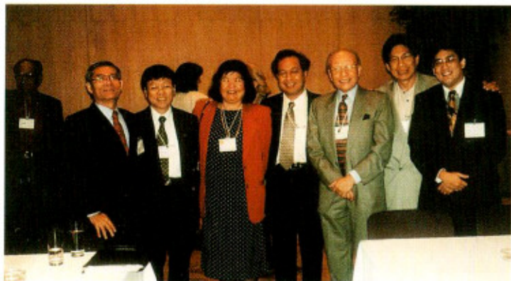
Some HBSACM delegates.