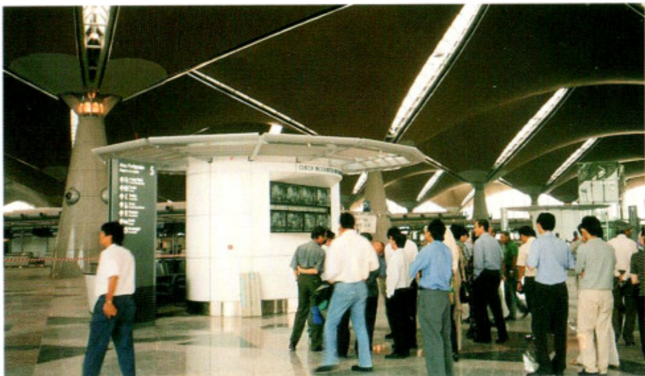
HBSACM members admiring the facilities at the KLIA Main Terminal.