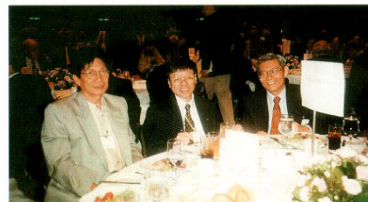
The President flanked by his exco.