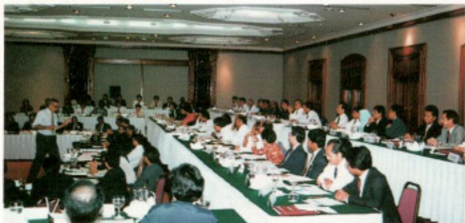
7th SENIOR MANAGEMENT DEVELOPMENT PROGRAM ORGANISED BY HARVARD BUSINESS SCHOOL ALUMNI CLUB OF MALAYSIA AUGUST 2 - AUGUST 15, 1992