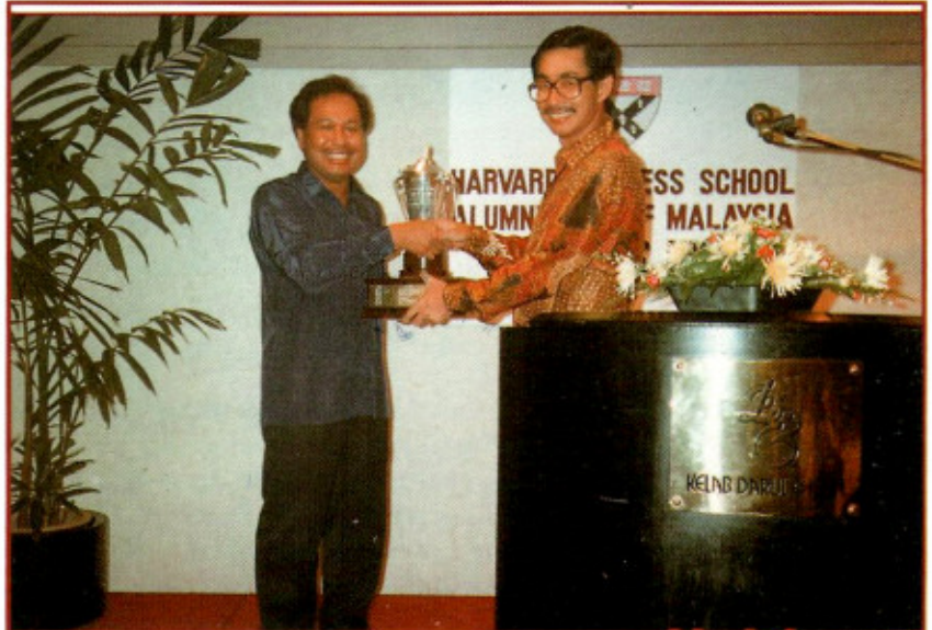
Congratulations to the Golf Champ!