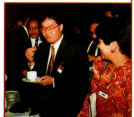
Taking a break during the SMDP.