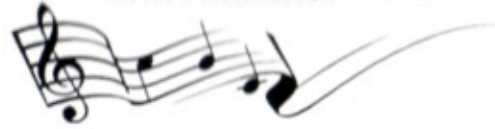
NETWORKING AT ITS MOST ENJOYABLE